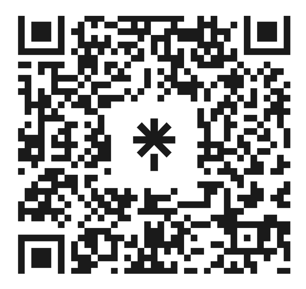
Scan the QR code above